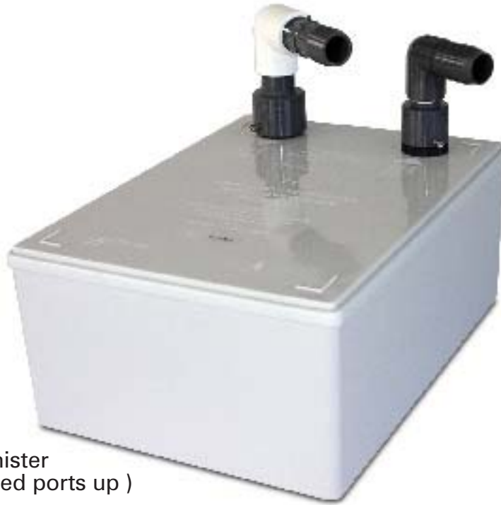
Main canister ( always positioned ports up )